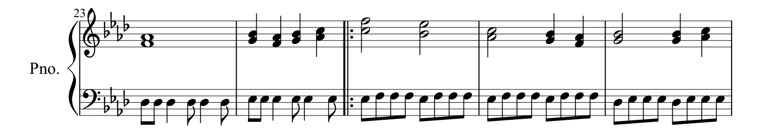
* The A and D should not overpower the left hand. If you try to focus on making the A speak more than the D, your right hand will naturally be softer than the left.